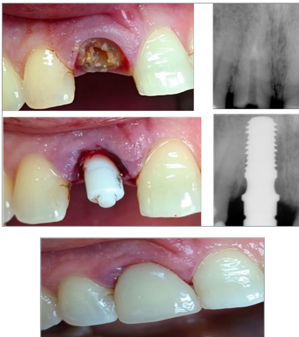
Figure 2: Stages of clinical work and R-control during work

matically removed, a developed allceramic immediate implant made of nanostructured zirconium dioxide with bio-coating was installed, and prosthetics were performed. (Figure 2)