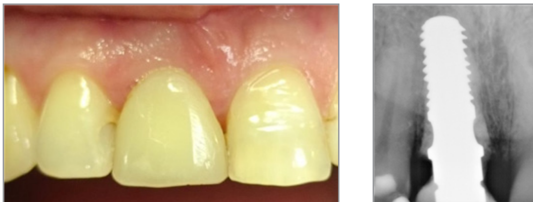
Figure 3: Appearance and R-control of bone condition (3 months)

work was completed in 1.5 hours. The patient was very happy. The postoperative period proceeded without the formation of external edema, the patient did not take painkillers. Due to her busy schedule, the patient was only able to come for a checkup on 05.03.2024. We performed an examination and an R-scan to monitor the condition of bone tissue (Fig. 3)