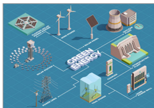
Figure 3: 10 Most Critical Technologies for Climate Change Mitigation

The economic impacts of Artificial Intelligence (AI) on climate initiatives are profound and multifaceted, influencing both the trajectory of green technologies and the overall sustainability of economic systems. By driving innovation and efficiency in energy production and consumption, AI not only facilitates the transition to renewable energy sources but also generates new job opportunities and markets. As investments in AI-powered climate solutions grow, understanding these economic implications becomes crucial for policymakers and businesses aiming to balance environmental goals with economic viability. See Figure-3, where the science of climate change depicted as 10 most crucial technologies and is explained accordingly in artistic format for climate change mitigation as AI gets involved.