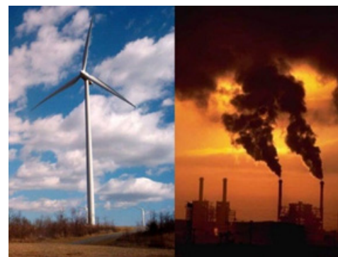
Figure 1: Renewable Energy VS Fossil Fuels

A pivotal factor contributing to climate change is the increasing demand for energy, driven largely by population growth and urbanization. The global population is projected to reach approximately 9.7 billion by 2050, necessitating a dramatic increase in energy production and consumption. Traditional fossil fuel-based energy systems, however, are not sustainable and exacerbate the climate crisis as Figure-1 is illustration of a battle that is looming over renewable energy, and fossil fuel interests are losing. Therefore, there is a critical need to transition to more sustainable energy sources that can meet the demands of a growing population while minimizing environmental impacts.