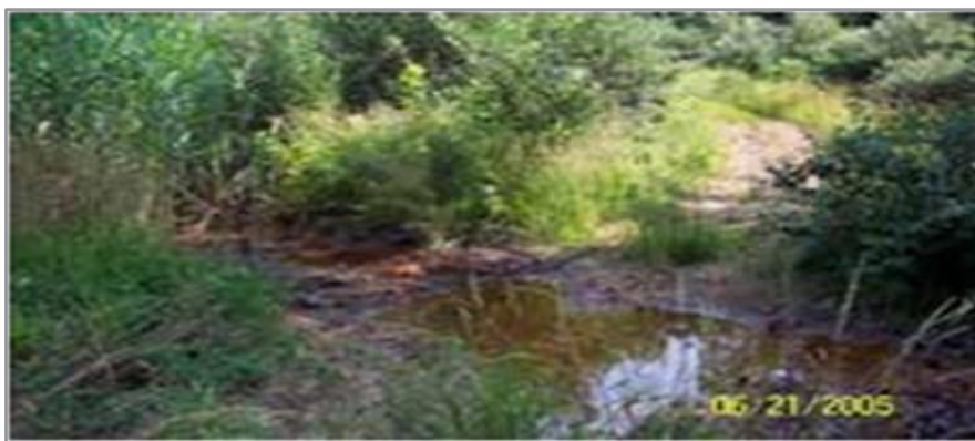
Figure 3: Marshall Equipment Acid Mine Drainage Seep 2007.