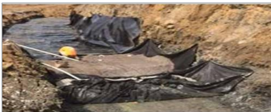
Figure 5: Richardson Coal Company LCD Construction.

made it nearly impossible to ensure proper construction. This piping for sampling ports proved to be very hard to maintain completely vertical to the surface. It was also very difficult to ensure the connection between the vertical pipes for these sampling ports and the main pipe network, running within the drain, remained in place and functioning, once backfill material was placed and compacted. The entire pipe system was removed from subsequent designs (see figure 5 and 6).