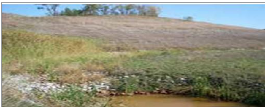
Figure 6: Marshall Equipment Reclaimed Highwall and LDC Sediment Basin 2010 (image: Olga Moya Aranzubia).

Another challenging aspect identified, post-construction of the LCD system, was the removal of settled solids. While riprap lined settling basins were very practical and easy to construct, they became difficult to maintain. These three LCD systems were built without any type of modelling for sizing, making it difficult to estimate the amount of precipitate that would be dropping out of solution at the outlet basins. While the original system at the Marshall Equipment site remains functional and precipitate sediment is being adequately handled, the Richardson Coal Company LCD system basins reached capacity after six years. A remedial project was completed to remove existing sediment from the basins at the Richardson Coal Company site. The clean out proved to be time consuming, due to the riprap