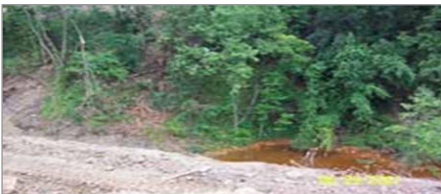
Figure 4: Marshall Equipment Phase Acid Mine Drainage Seep 2007.