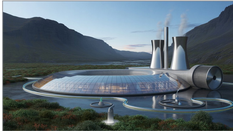
Figure 2: Geothermal Plant Model Applying Architectural Design

Flash steam power plants are the most common type of geothermal power plant in operation today. These facilities tap into high temperature geothermal reservoirs, specifically those with water temperatures exceeding 360°F (182°C). In this type of system, high pressure geothermal water is brought to the surface, where the pressure is reduced (or "flashed"), causing a portion of the water to convert to steam. This steam is then used to drive a turbine. The remaining water can be reinjected into the reservoir, making this process efficient and sustainable [21-25].