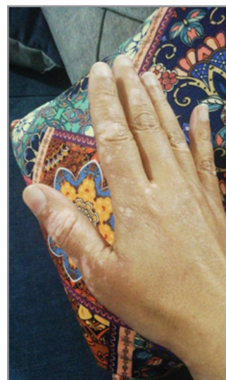
Case 11: Vitiligo Due to Hashimotos Thyroid Disease Treatment Thyroxine Tablets 75 mg and Leukogo Cream.