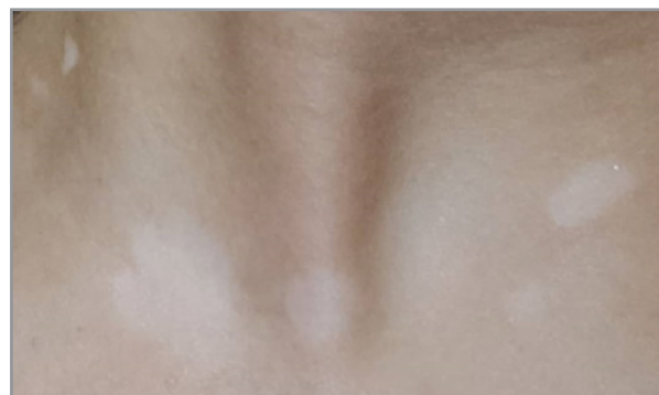
Case 3: Impetigo Contagiosum Treatment Topical and Oral Antibiotics