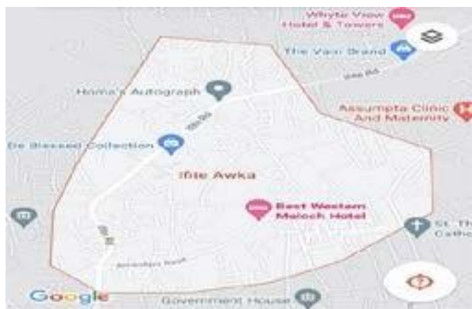
Figure 1: Map showing Ifite Awka: https://maps.app.goo.gl/zVMB0DoK3LQTbAKd9

This study was conducted in Ifite-awka Community Awka South L.G.A, Anambra state. The study took place between October and November, 2021. Ifite-awka in the region of Anambra State is a town located in Nigeria- some 317km south of Abuja, the country's capital. Ifite-awka is situated in Awka South, Anambra, Nigeria, its geographical co-ordinates are 6° 15' 11" North, 7° 0' 51" East and its Original name is Ifite-Awka. Typically, the temperature ranges between 27°C and 30°C from June to December but climbs to 32°C to 34°C from January to April, with the latter three months of the dry season having intense heat. The area is densely populated by staff and students of Nnamdi Azikiwe University (NAU) as well as public servants who live in and around commissioner's quarter's axis due to its proximity to the Anambra State Government. The villages that made up of Ifite-Awka is Enu-Ifite, Ezinato-Ifite and Agbada-Ifite [9].