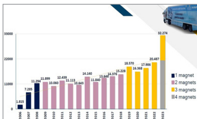
Figure 2: Number of MR scans performed in the MRI mobile units since 2006

Program started in 2006 with one 1.5T mobile MRI unit, a second one was bought in 2008, a third one in 2019, and a fourth one is operating since 2023 (Figure 2).