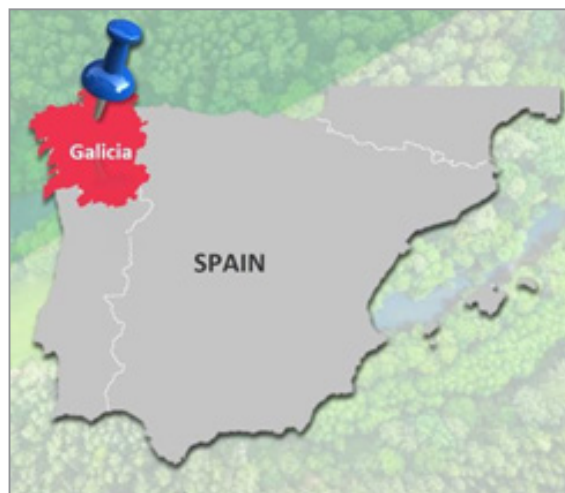
Figure 1: Localization of Galicia, a region in the Northwest of Spain

In Galicia, a region in Northwest Spain (Figure 1), 30% of residents live in villages with fewer than 1,000 inhabitants, and 25% are over 65 years old [6]. With such a much-dispersed and aged population, the public healthcare system has filled service void in secondary hospitals without in-house magnets with mobile MRI units since 2006.