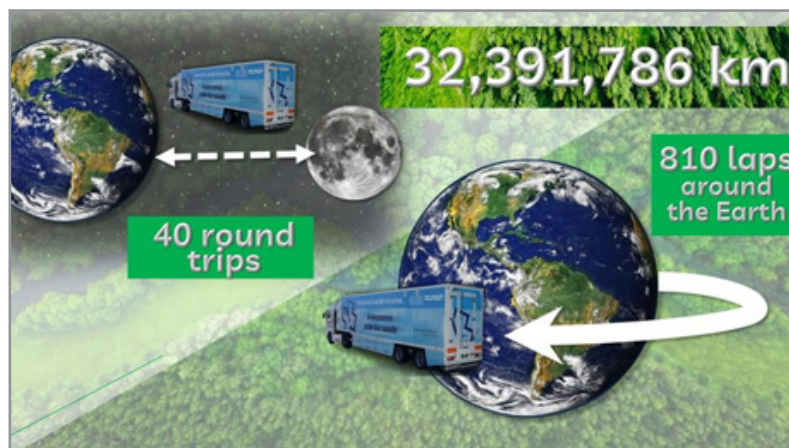
Figure 4: Number of travel patients kilometers saved by patients with the MRI mobiles

As there is no travel required by the patient in order to benefit from MRI services, since 2006 5,000 tons of CO 2 have been avoided (Figure 5) [4, 7].