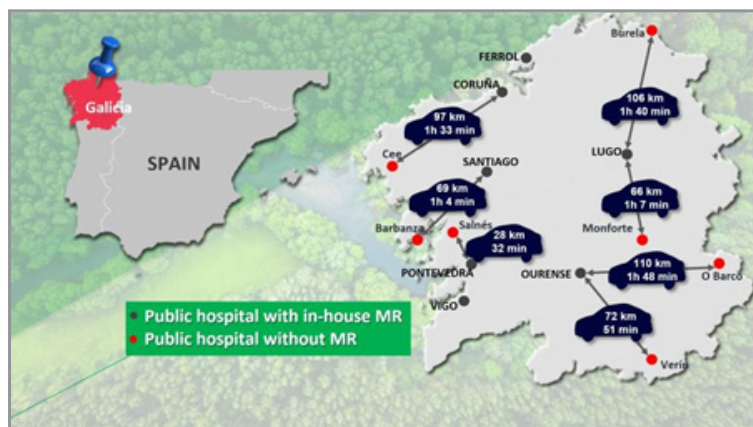
Figure 3: Distribution of public healthcare hospitals in Galicia. Distances and time by car from public hospitals without MR to the nearest public hospital with an in-house MR

Mobile MRI units cover various locations, including all the seven public second level hospitals without in-house MRI magnets, and five public third level hospitals across Galicia's four provinces (A Coruña, Lugo, Ourense, Pontevedra), in an area of 29,574 km 2 , contributing to serve a population of 2.7 million inhabitants (Figure. 3) [6].