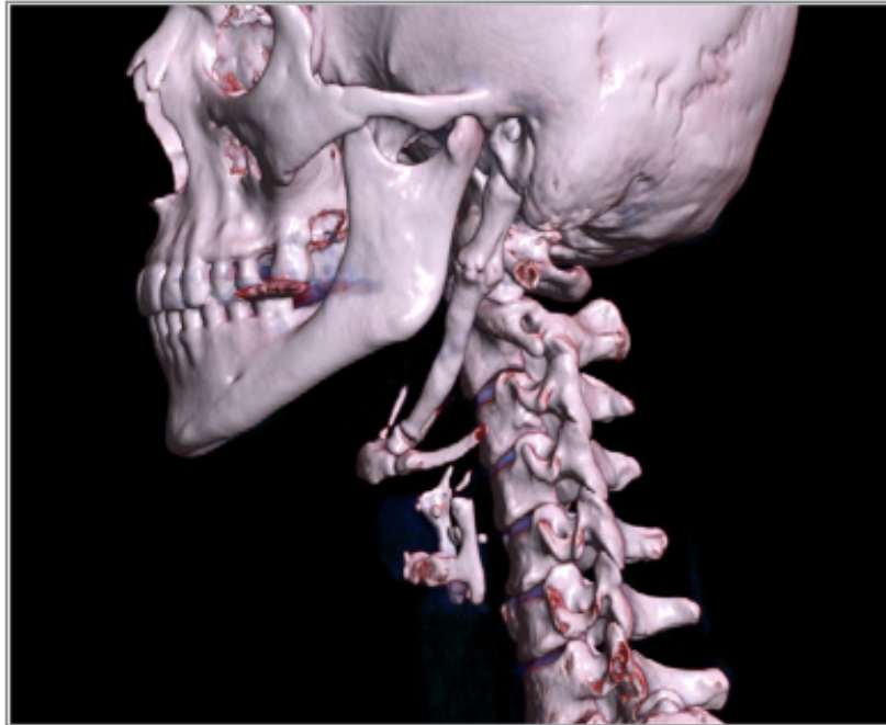
Figure 1: Multidetector computed tomography (MDTC) with 3D volumetric reconstructions (3D-VR) - left-sided sagittal view.