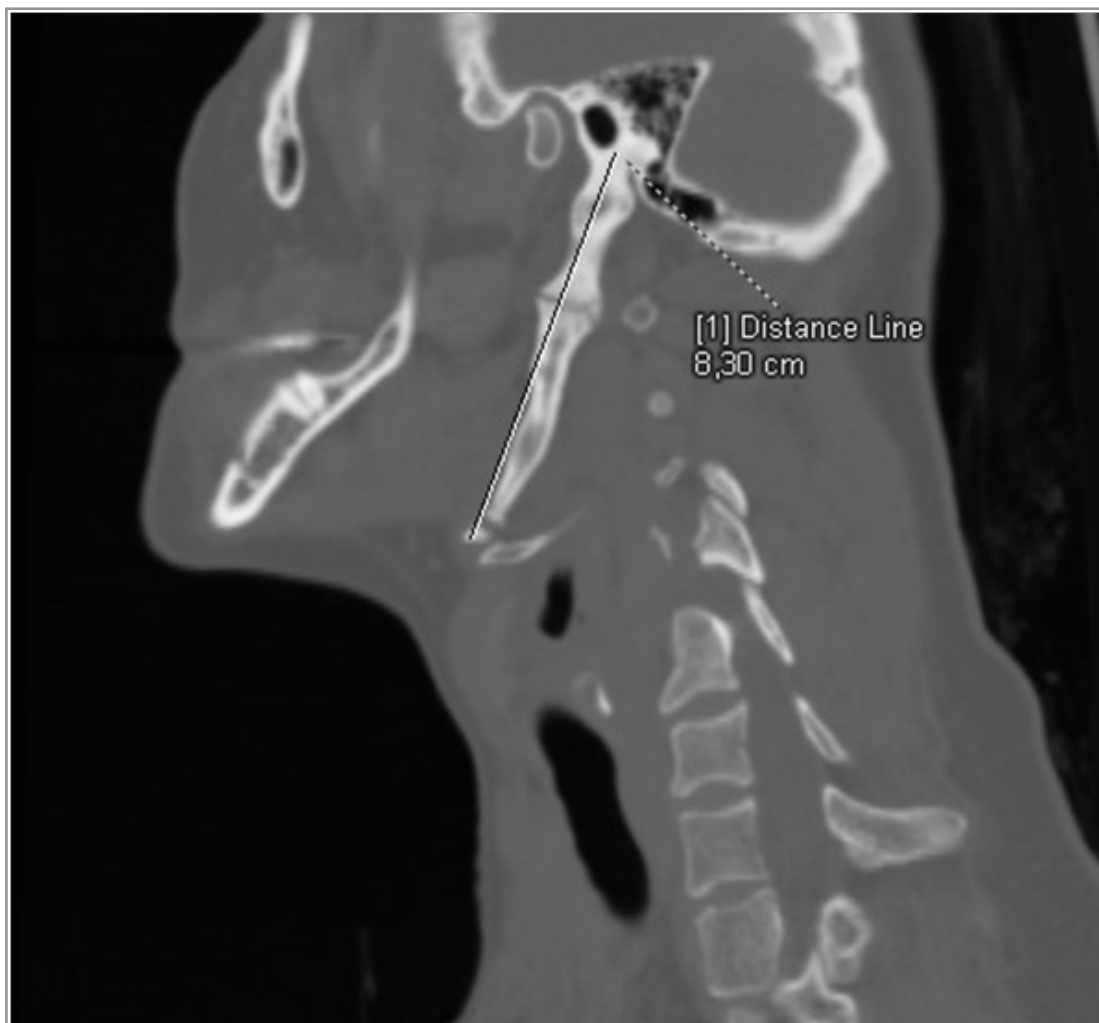
Figure 2: Multidetector computed tomography (MDTC) with multiplanar reconstructions (MPR) - left-sided sagittal view. Measurement of the overall length of the left styloid process.