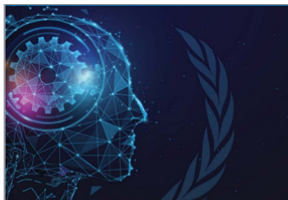
Figure 3: United Nations Activities on Artificial Intelligence (AI) 2022 [7]

Using AI is not risk-free. Its algorithms—the machinery that distills intelligence from unprocessed data—may.