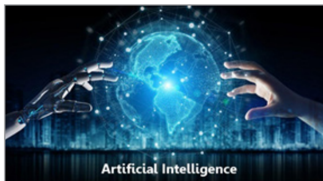
Figure 5: Artificial Intelligence Driven Global Economy

Moreover, AI's potential in healthcare is monumental. It is transforming the diagnosis, treatment, and management of diseases, reducing healthcare costs and improving patient outcomes. AI applications range from drug discovery and genomics to personalized treatment plans and telemedicine, making healthcare more accessible and efficient worldwide. Figure-5