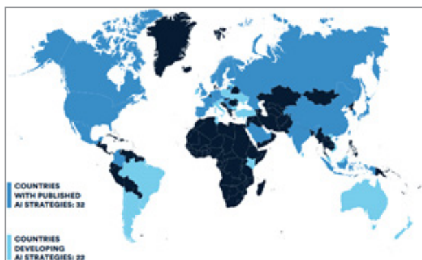
Figure 2: AI Driven Technology National and Regional Strategies

Figure-2 represents, over the next several decades, artificial intelligence (AI) will likely have a significant impact on global competitiveness, offering early adopters a considerable tactical and financial edge. National governments, as well as regional and international organizations, have been rushing to implement AI-focused regulations in order to fully realize the technology's potential and address its ethical and societal ramifications.