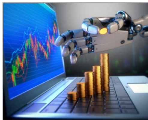
Figure 9: AI Driven Cryptocurrency

AI's impact on the global economy is a more comprehensive concept, encompassing how artificial intelligence technologies influence economic growth, efficiency, and productivity across various sectors. Cryptocurrency, as a digital financial innovation, is one of the many outcomes of AI and technological advancements that contribute to changes in the global economy. However, its impact on the global economy is not that significant. See Figure-9 as a conceptual impact of the cryptocurrency utilizing Artificial intelligence system [AI, AL, DL].