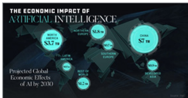
Figure 4: The Economic Impact of Artificial Intelligence

One of AI's most significant contributions to the global economy is the enhancement of productivity and efficiency. AI-driven automation and machine learning algorithms have revolutionized the way tasks are performed, streamlining processes and reducing the margin of error. This, in turn, has led to increased economic output, improved resource utilization, and substantial cost savings for businesses across the globe. Companies have harnessed AI's capabilities to optimize their supply chains, automate routine tasks, and develop innovative products and services, ultimately boosting their competitiveness in the global marketplace. See Figure-4