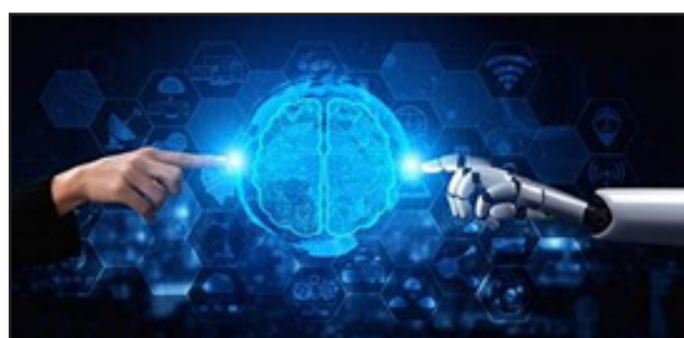
Figure 11: AI and Human at Work

Digital twins mimic the behavior of physical assets using real-time data, enabling ongoing monitoring and optimization. AI and ML algorithms can analyze the data generated by digital twins to predict future states, optimize performance, and even guide the design of new systems. This idea is gaining traction in industries including manufacturing, aerospace, and energy since it may significantly reduce costs and increase efficiency by simulating and optimizing processes in a digital setting. See Figure-11