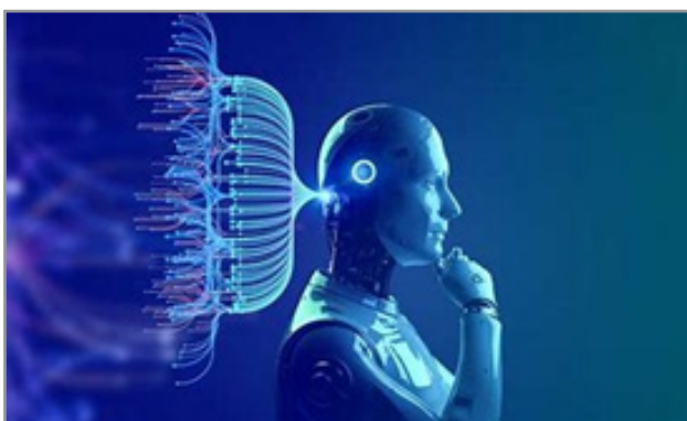
Figure 9: AI Selecting Right Data Drive Anomaly Detection

Another key area where AI and ML excel is in predictive maintenance and anomaly detection [13]. Digital systems equipped with AI can predict equipment failures before they occur by analyzing historical and real-time data. See Figure-9