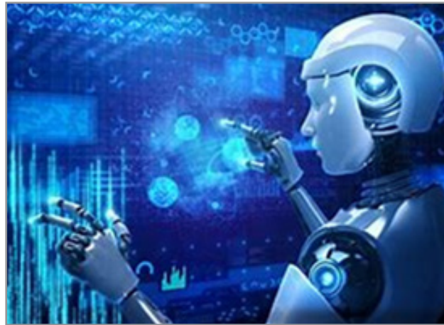
Figure 5: Artificial intelligence at Work

Advanced Reactor Control and Operations (ARCO) systems are at the heart of nuclear reactor safety and performance. These systems manage a complex array of variables, from reactor temperature and pressure to neutron flux and fuel integrity. Traditionally, these tasks have been managed by analog systems that, while reliable, have limitations in terms of scalability, data integration, and real-time analysis. AI/ML augmentation enhances the operation. See Figure-5