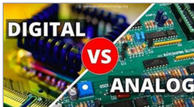
Figure 4: Digital IC Versus Analog

The ongoing shift from analog to digital systems across industries will be greatly aided by the continued development of digital integrated circuits (ICs). Refer to Figure 4.