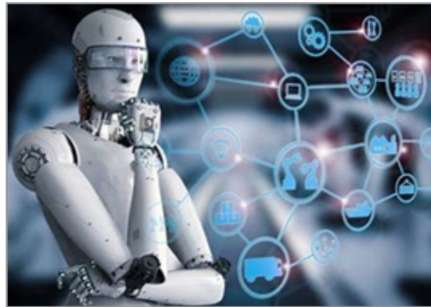
Figure 3: Artificial Intelligence Learning Transformation

Furthermore, the transition to digital systems powered by AI and ML offers significant economic benefits by reducing operational costs, optimizing resource utilization, and enabling more efficient and scalable solutions across industries (See Figure-3 that presents real time AI/ML solution by fly) [6].