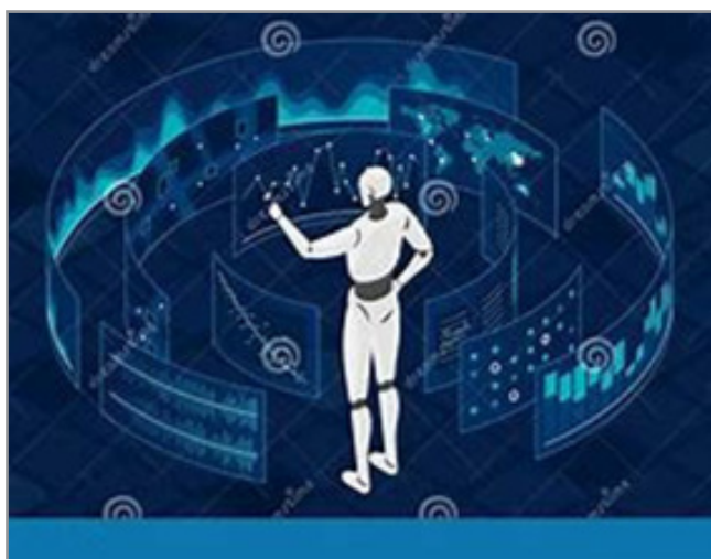
Figure 7: AI Driven Data Processing & Analysis in Control Room

Processing and analyzing enormous volumes of data in real-time is one of AI and ML's most important contributions to this revolution. Large amounts of data are generated by digital systems, substantially more than old analog systems could process (See Figure-7). AI and ML algorithms can sift through this data, identify patterns, and extract valuable insights, enabling more informed decision-making and predictive analytics.