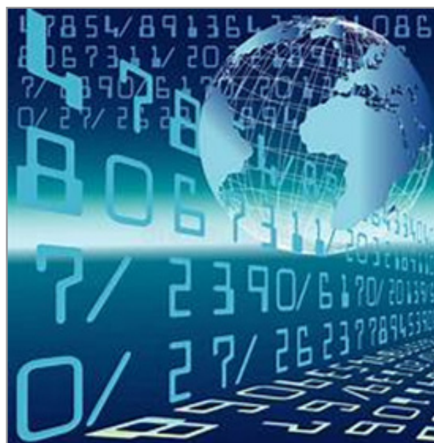
Figure 2: Digital World of High Tech and Data Stok Illustration

The transformation from analog to digital technology marks a significant evolution in many industries, particularly in nuclear energy and advanced electronics sectors. This shift is driven by the advancements in Integrated Circuit (IC) technology, which have enabled the development of highly sophisticated digital systems surpassing traditional analog devices' capabilities. As we move forward, the new generation of ICs is set to revolutionize how we approach control, communication, and computation across various applications. See Figure-2