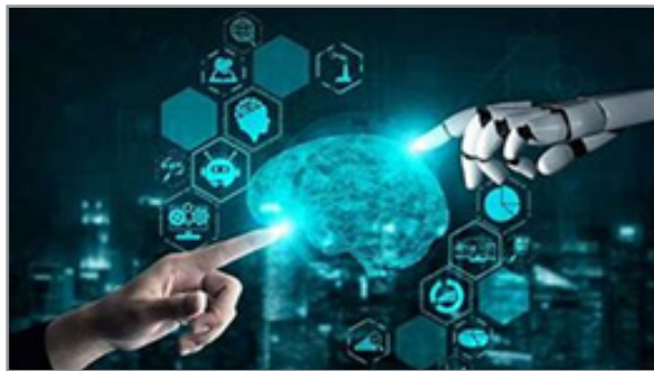
Figure 6: Collaboration of Human and Artificial Intelligence Illustration