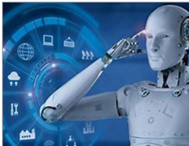
Figure 10: AI Selecting Right Data Drive Anomaly Detection

This is particularly relevant in environments that are hazardous or remote, such as space exploration or deep-sea operations. Even in less extreme scenarios, AI can serve as a decision support tool, providing human operators with real-time recommendations based on vast amounts of data, which is critical in high-stakes industries like nuclear energy.