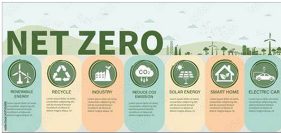
Figure 1: Zero Emission by 2050