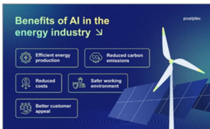
Figure 4: AI/ML Entanglement Driving Future Energy Industry.

In summary, the Role of Artificial Intelligence and Machine Learning explores how these advanced technologies enhance energy management, optimize production, improve grid reliability, and facilitate research and development, ultimately driving the transition to a more efficient and sustainable energy system.