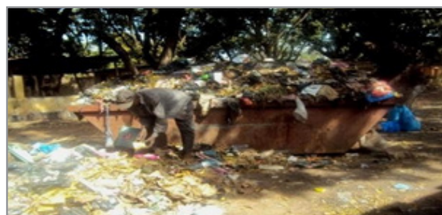
Figure 5: Collector looking for recyclable materials