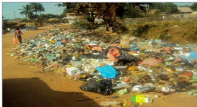
Figure 6: Accumulation of garbage on the road