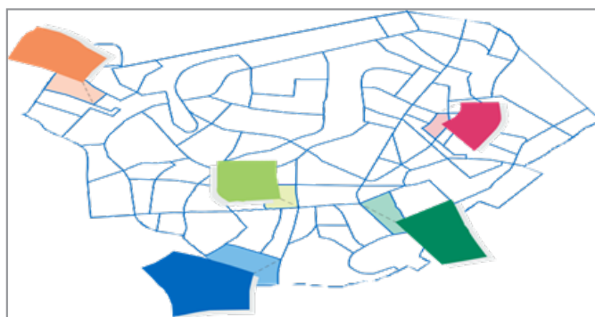
Figure 3: Map of the city of Bissau showing the assembly areas of the Bissau City Council (CMB).

For the collection of municipal waste in Bissau, CMB provides stationary waste containers at strategic points in the city, usually in places where waste collection vehicles corresponding to the various collection areas of the Bissau City Council (CMB) can be accessed (Fig. 3) or in the Praça area (centre) city, or on the main avenue.