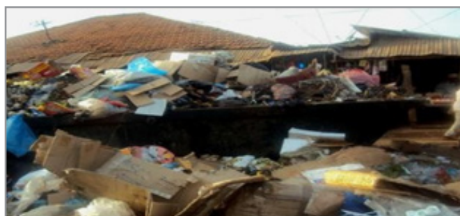
Figure 4: Container overfilled. Rice.

Therefore, practices such as burning and dumping waste are common in most areas of the city. The practice of dumping waste on vacant lots, public roads and drainage canals is also very common (Figures 6 and 7).