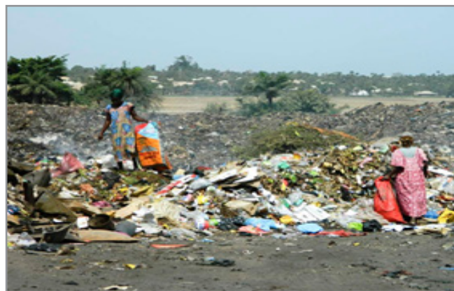
Figure 8: Official dumpsite of Bissau (Antula region)

The territory does not have an isolation fence, and the surveillance service is random, which ensures access to the territory by unauthorized persons and animals, as shown in (Fig. 8).