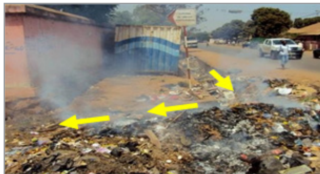
Figure 7: Drainage channel clogged with debris.