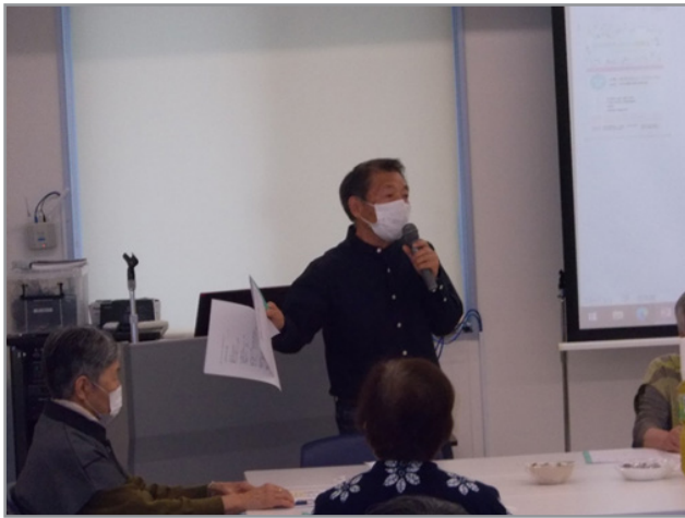
Figure 6: Statement from the President of the Affiliated Organization