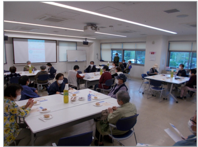
Figure 7: Overall Situation