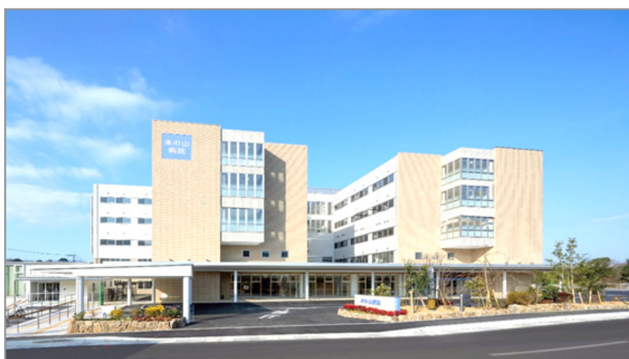
Figure 9: Komenoyama Hospital

In 2022, we joined HPH (Health Promoting Hospitals) and are aiming to become an “elderly-friendly hospital.”