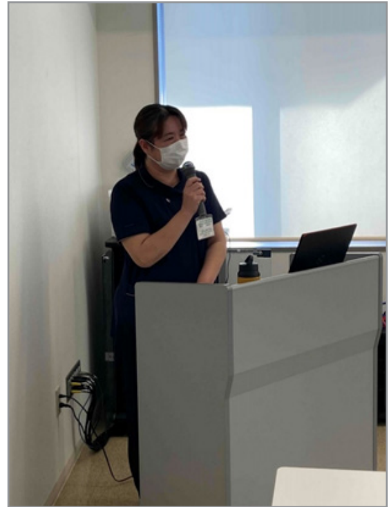
Figure 4: Lecture on Dental Hygiene by Dental Staff