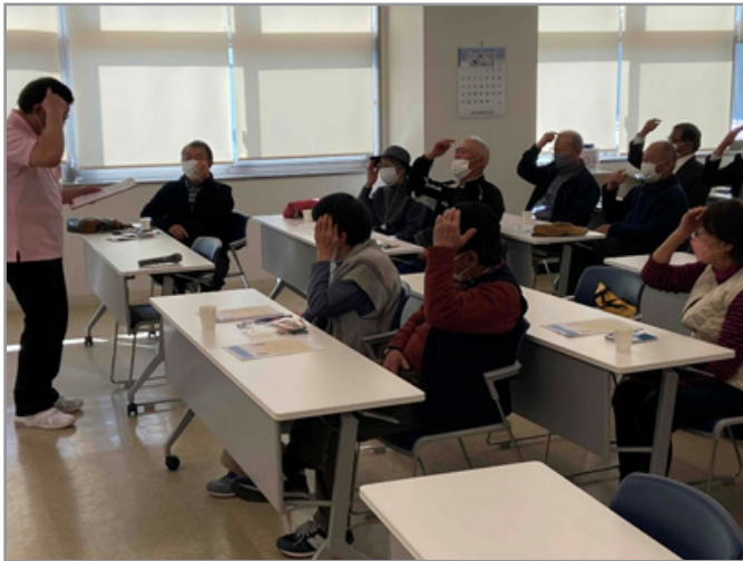
Figure 3: Brain Exercises by Rehabilitation Staff