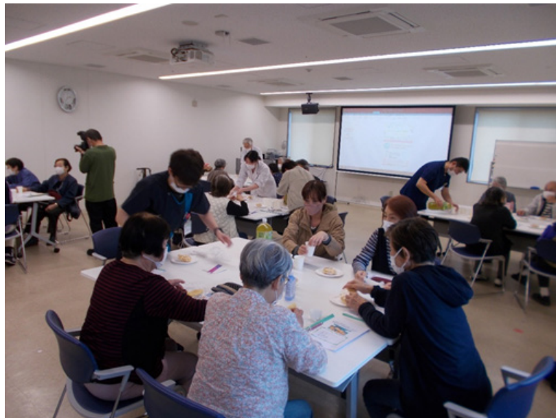
Figure 8: We divided into small groups and discussed our Second Dreams while eating self-homemade dorayaki.