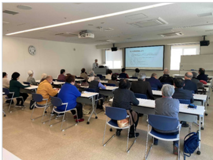
Figure 1: Overall Situation