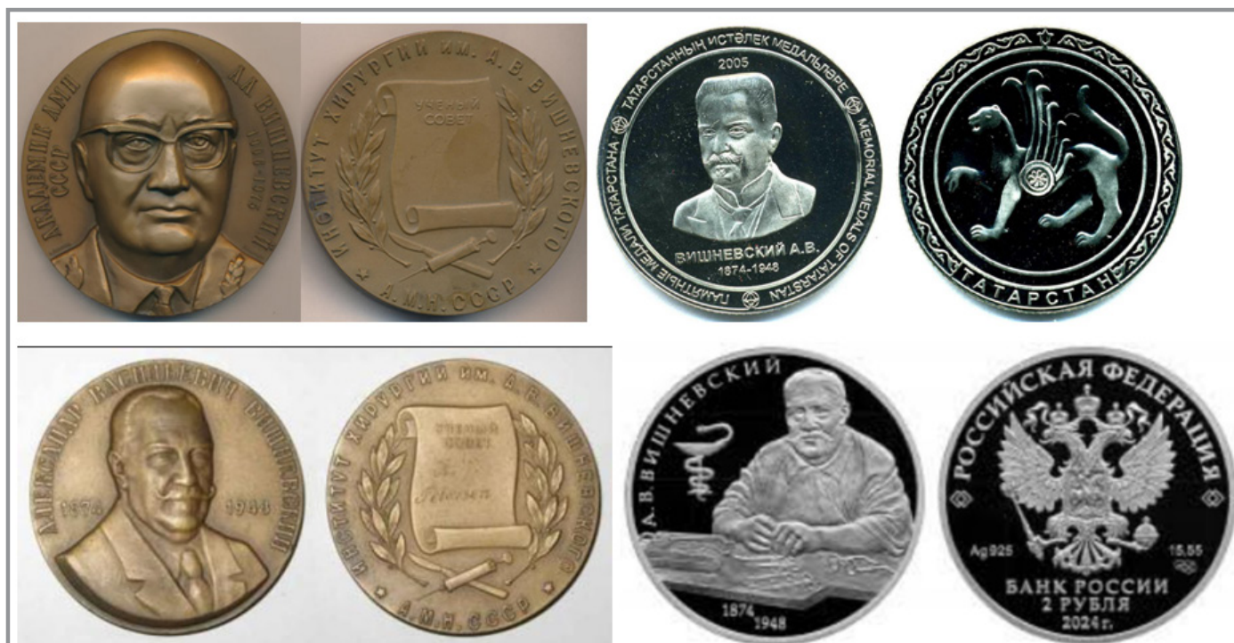
Figure 7: Numismatic Selection of Commemorative Medals and Coins dedicated to A.V. Vishnevsky

medals and commemorative coins, both from the USSR period and the modern Russian Federation, dedicated to A.V. Vishnevsky [33-37].