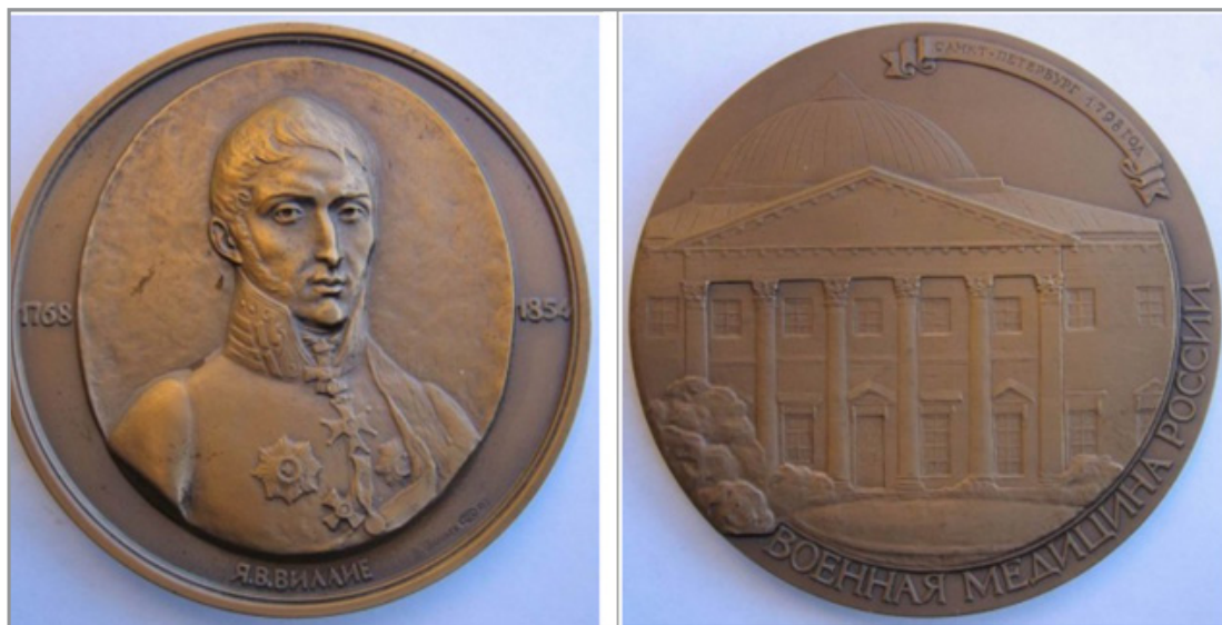
Figure 5: Commemorative Medal Dedicated to the Memory of the First President of the Medical-Surgical Academy of Russia - Ya.V. Willie

by origin. Since 1790 in St. Petersburg. Chief military medical inspector of the Russian army (1806-1854), president of the Medical-Surgical Academy (1808-1838). Participant in the Patriotic War of 1812. Initiator of the creation of the "Military Medical Journal". Author of the book "Russian Military Pharmacopoeia". He was buried at the Volkovskoye Lutheran Cemetery in St. Petersburg.