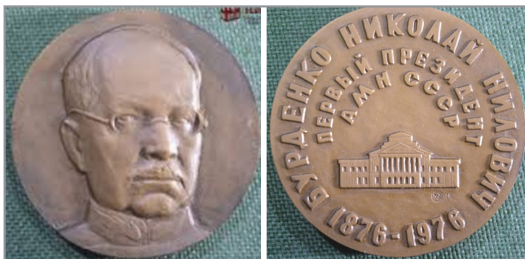
Figure 6: Commemorative Medal of the USSR Dedicated to Nikolai Nilovich Burdenko

in 1937-1946, academician of the USSR Academy of Sciences (1939), academician and first president of the USSR Academy of Medical Sciences (1944-1946), colonel general of the medical service, participant in the Russo-Japanese, First World War, Soviet-Finnish and Great Patriotic Wars. Honorary member of the London Royal Society of Surgeons and the Paris Academy of Surgery. Chairman of the Soviet commission that investigated the Katyn massacre of Polish servicemen [32].