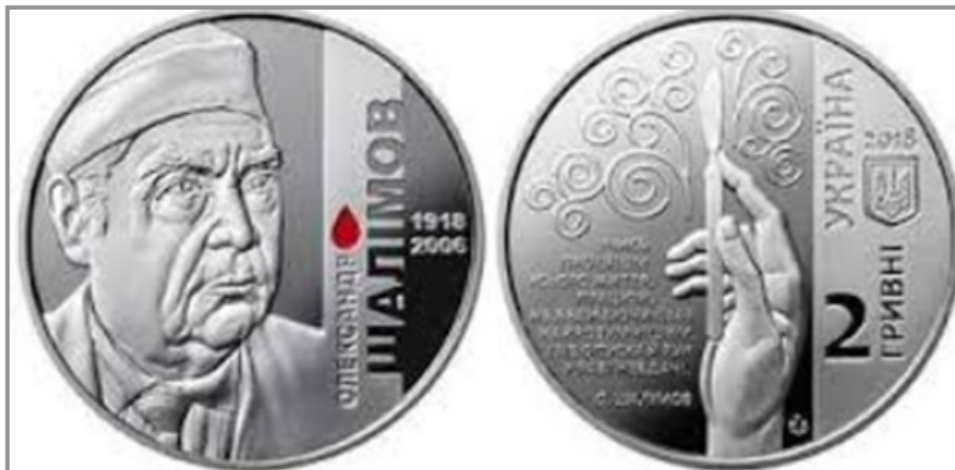
Figure 9: Commemorative Coin of Ukraine Dedicated to the Famous Surgeon and medical scientist, Shalimov Alexander Alekseevich

commemorative coin, in profile, turned to the right, is a portrait of this scientist and doctor, as well as his biographical data. On the reverse of this coin, a hand is depicted with a surgical scalpel, raised and directed upward and upward. Next to this image, there is a quote (in Ukrainian) from this scientist and surgeon: "Learn throughout your life, work without considering yourself the smartest, and don't give up in case of failure."