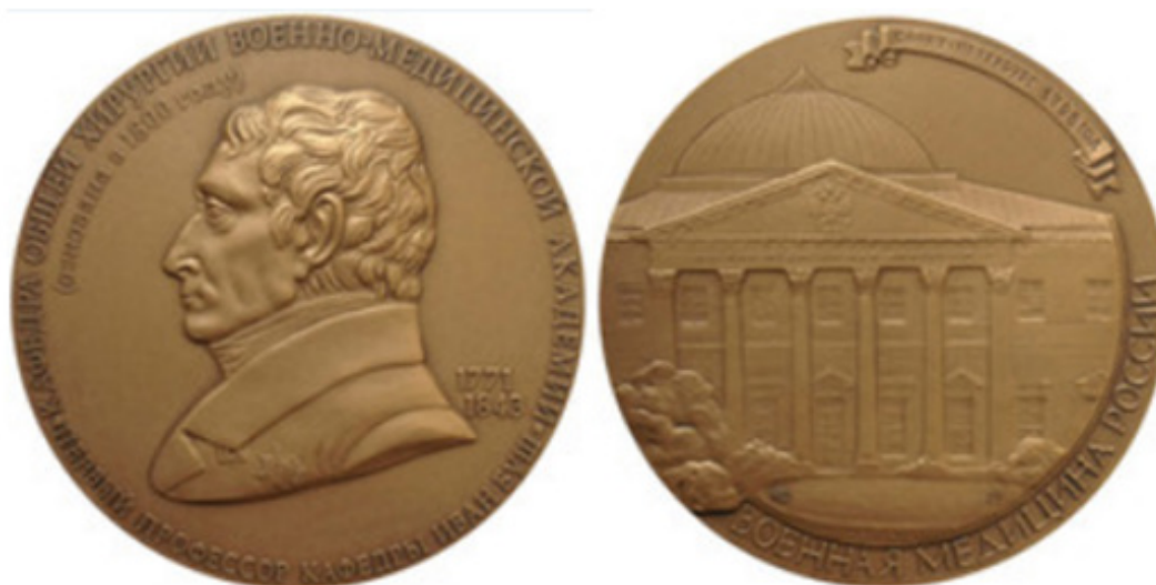
Figure 3. Commemorative Medal Dedicated to the Memory of I.F. Bush

St. Petersburg Imperial Medical-Surgical Academy. He created a system of surgical training of doctors and the first, largest, Russian surgical school, was the author of a fundamental manual on surgery. He was, in fact, the first teacher of surgery at the Medical-Surgical Academy. Students of I.F. Bush, occupied departments in the main medical higher educational institutions of the then Russian Empire [24, 25].