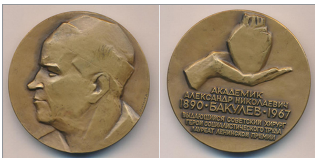
Figure 10: Commemorative Medal Dedicated to Academician A.N. Bakulev

of Sciences. Honored Scientist of the RSFSR (1946). In the 1950s, Bakulev became a true pioneer of cardiovascular surgery, he developed and applied innovative methods of treatment (in particular, cardiac catheterization, angiocardiology, closed commis-surotomy), and also organized the Institute of Thoracic Surgery (1955). [41, 42].