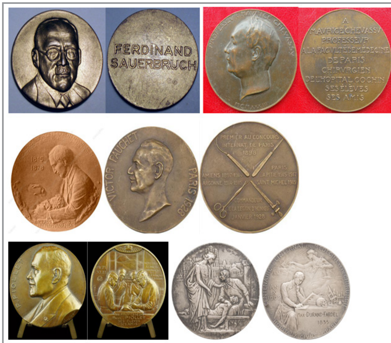
Figure 1: Numismatic Collection of Commemorative Medals, Thematically Dedicated to a Number of Famous Surgeons, from Different time Periods and Different Countries of the World

Next, in thematic figure 2, a selection of commemorative medals of such countries of the world as Ukraine and Russia, as well as a number of well-known, different years, surgeons of these countries are presented [18-23]. I would like to begin the presentation of this numismatic selection (commemorative coins and medals) with the presentation of collection materials dedicated to the world-famous surgeon and scientist, surgeon, founder of military field surgery, operative surgery and topographic anatomy, in Russia, scientist-anatomist - Nikolai Ivanovich Pirogov