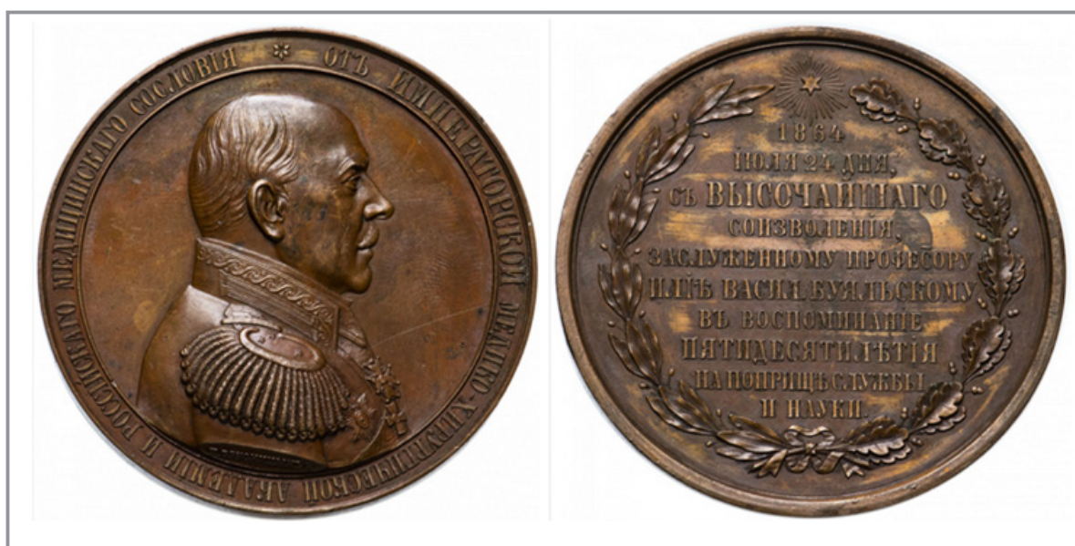
Figure 4: Commemorative Medal Dedicated to the Memory of I.V. Buyalsky

and practice of forensic medicine, and also one of the founders of human topographic anatomy. I.V. Buyalsky devoted his main scientific works to normal, topographic and pathological anatomy, as well as vascular surgery and surgical treatment of urolithiasis. [26-28].