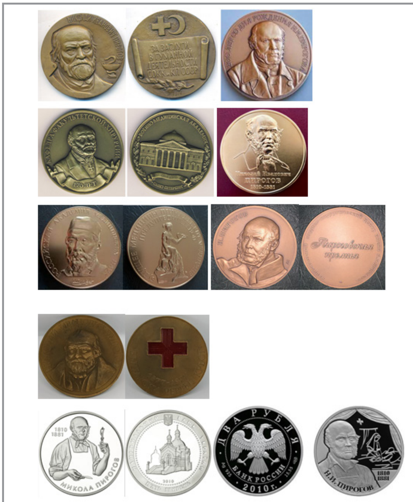
Figure 2: Numismatic Collection Dedicated to the Memory of N.I. Pirogov