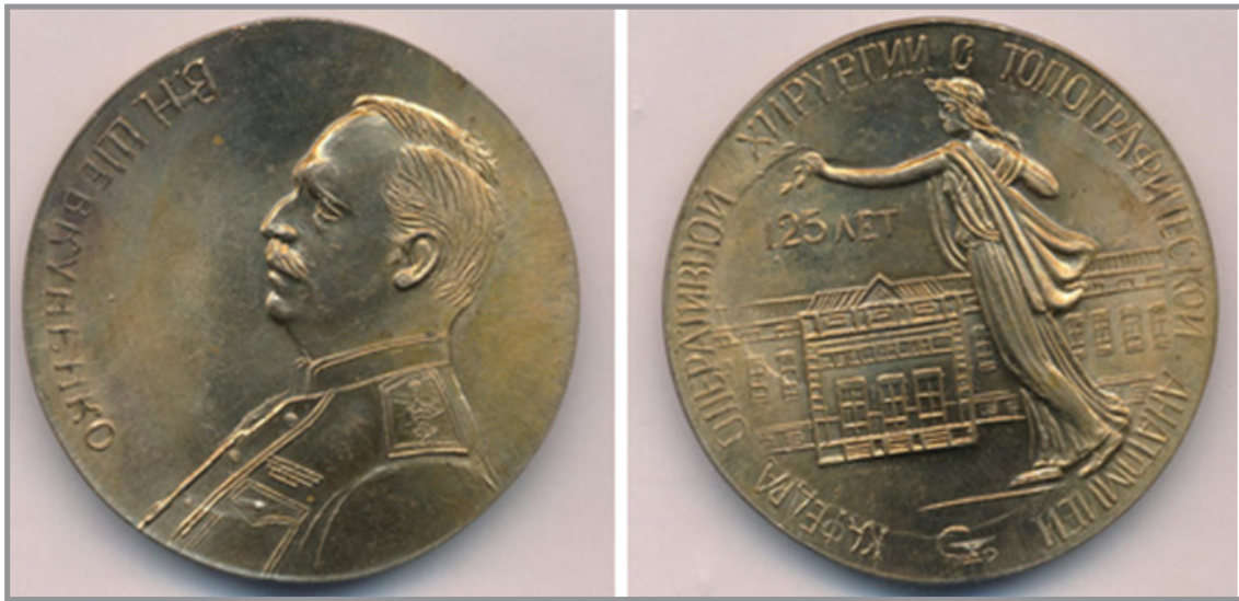
Figure 11: Commemorative Medal Dedicated to the Surgeon V.N. Shevkunenkov, Famous in the USSR and Russia

This completes another author's thematic research article devoted to the reflection in numismatics, surgery and surgeons. The author is preparing for publication another new article, based on the materials of his new research, the reflection of different areas of surgery, in traumatology, resuscitation and intensive care, in the reflection of different means of collecting