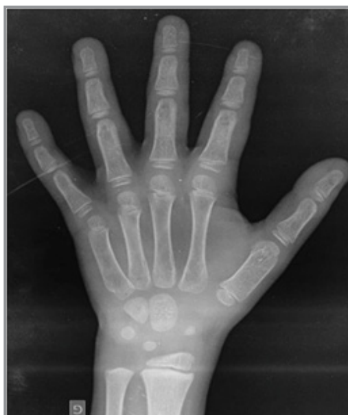
Figure 1: An illustration of a radiography of left hand and wrist

Image Acquisition and Bone Age Assessments: Images were acquired using a Siemens Polydors D general radiography machine. Radiographs of the left hand were acquired using the following exposure settings: 46–50 kVp, 2.0 mAs, SID 100 cm and with no grid. Images were read on a vendor approved console (Fig.1). Independent bone age estimations by two radiologists with more than 10 years of clinical experience in radiology. BA estimates were obtained using the Greulich and Pyle's Radiographic Atlas of Skeletal Development of the Hand and Wrist. Both radiologists were blinded to the chronological age of the patients.