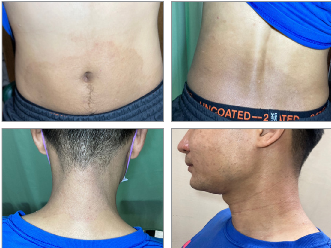
Figure 2: On September 18, 2023, A) the abdomen and B) the back showed significant fading of the erythematous psoriasis patches, with the keratin layer becoming thinner and the borders less distinct. C) The posterior neck and D) the face and left side of the neck showed a substantial reduction in skin redness and swelling, with the thickened, keratinized layer becoming thinner and the most noticeable changes at the borders. The BSA decreased to 17%, and the PASI score dropped to 3.9.